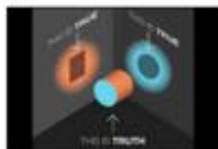
Jesus and Pilate